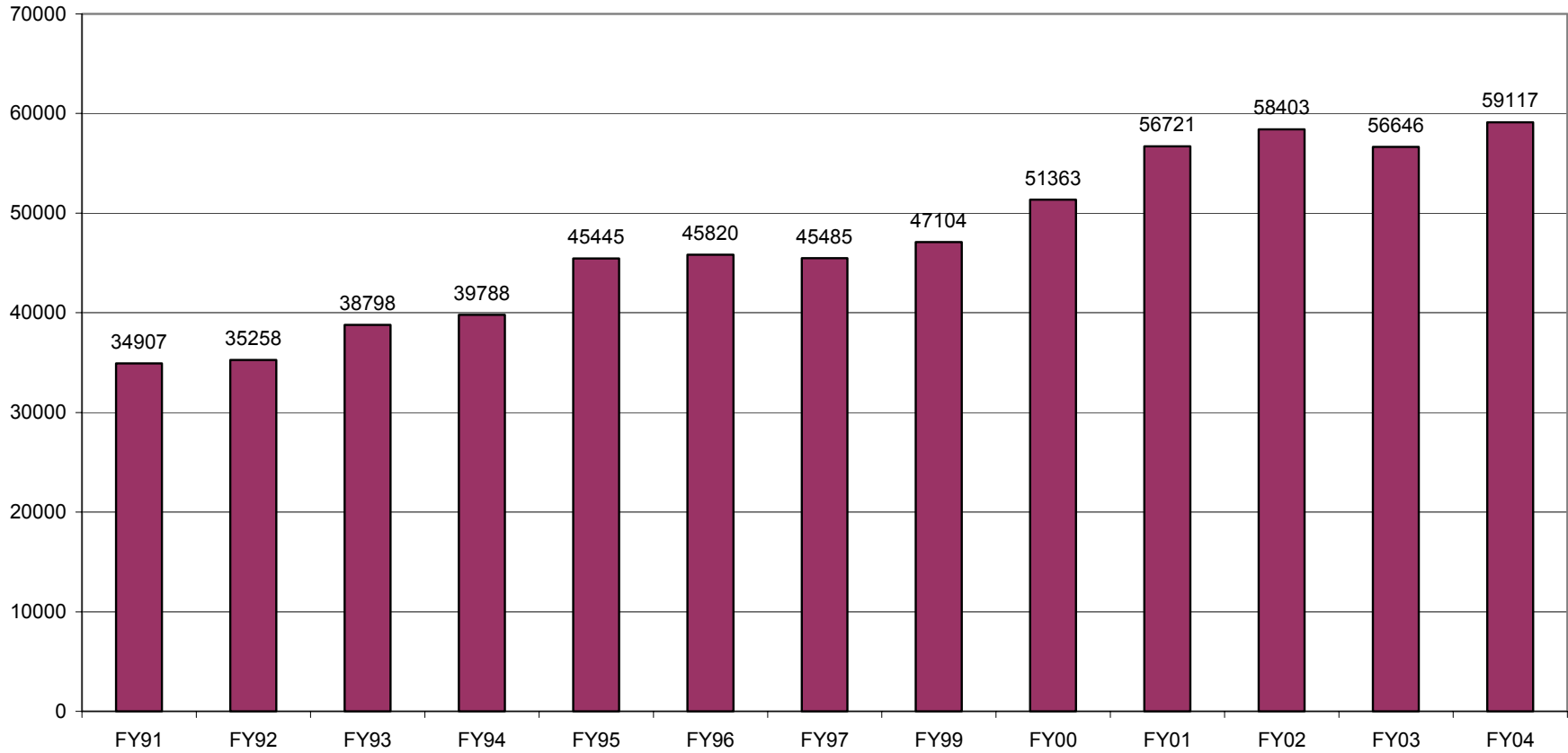
Clients Served by Domestic Violence Programs FY91 to FY04 (*FY98 data is not accurate due to change in data collection systems mid-year)